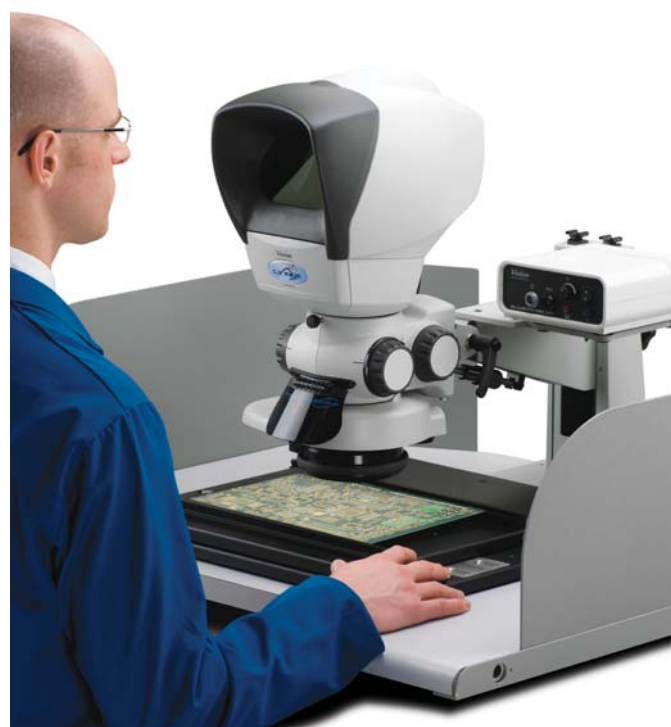
Oblique and direct viewer allows a 34° from vertical view, which can be rotated through 360° for superb stereo view of 3-dimensional subjects.

Lynx VS8 is a variant of Vision Engineering's Lynx stereo microscope. Lynx utilises Vision Engineering's patented Dynascope™ technology to offer the user advanced ergonomics by removing the need for restrictive eyepieces. Lynx VS8 is in use in tens of thousands of PCB manufacturing sites worldwide and provides optimum ergonomics to reduce fatigue, increase operator accuracy and reduce scrap.