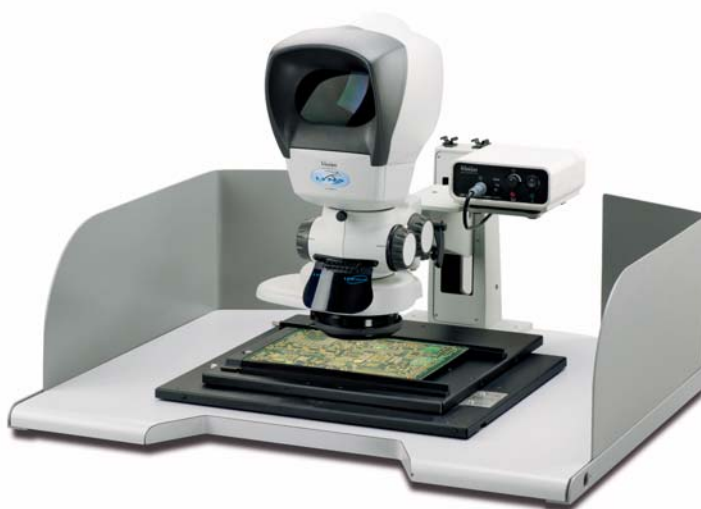
Lynx VS8 with patented eyepieceless optics for specialist PCB inspection.