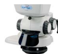
Oblique and direct viewer