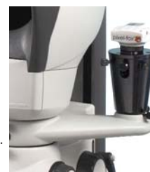
Image capture and archive