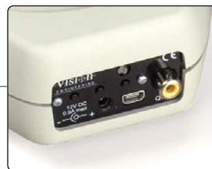
Connectivity via USB 2.0, or composite video