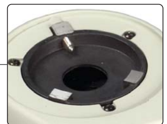
Available in mono and stereo variants